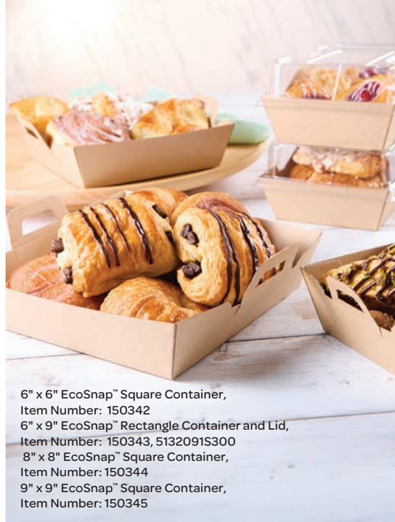
6" x 6" EcoSnap™ Square Container, Item Number: 150342 6" x 9" EcoSnap™ Rectangle Container and Lid, Item Number: 150343, 5132091S300 8" x 8" EcoSnap™ Square Container, Item Number: 150344 9" x 9" EcoSnap™ Square Container, Item Number: 150345