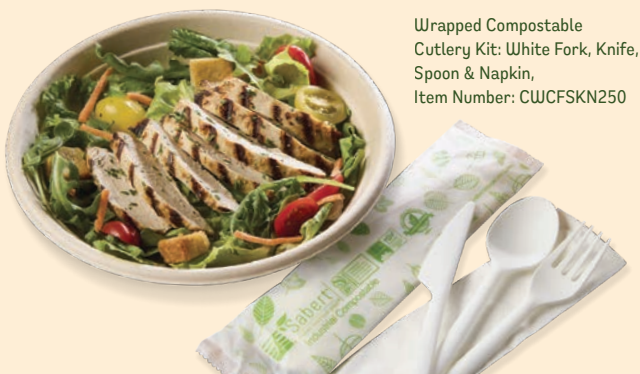
Wrapped Compostable Cutlery Kit: White Fork, Knife, Spoon & Napkin, Item Number: CWCFSKN250

of shoppers said they value brand authenticity and want brands to be truthful and transparent about company environmental credentials. 1