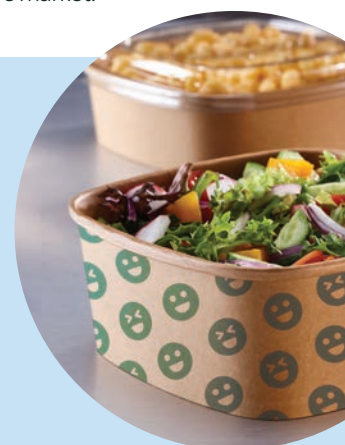
Custom printed packaging allows you to infuse your brand's identity into every meal, helping to maintain a strong connection with consumers. Kraft 32 oz. Paper Square Bowl and Lid, Item Number: PK27032D300, 512207D300N