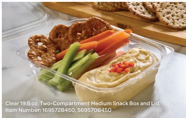
Clear 19.5 oz. Two-Compartment Medium Snack Box and Lid, Item Number: 169572B450, 569570B450

Today's health-conscious consumers are searching for ingredients that reflects their desires for overall wellness, whole nutrition and more sustainable food production. The increasing popularity of weight loss medications is also influencing eating habits, driving even more demand for healthier, more balanced foods. 2