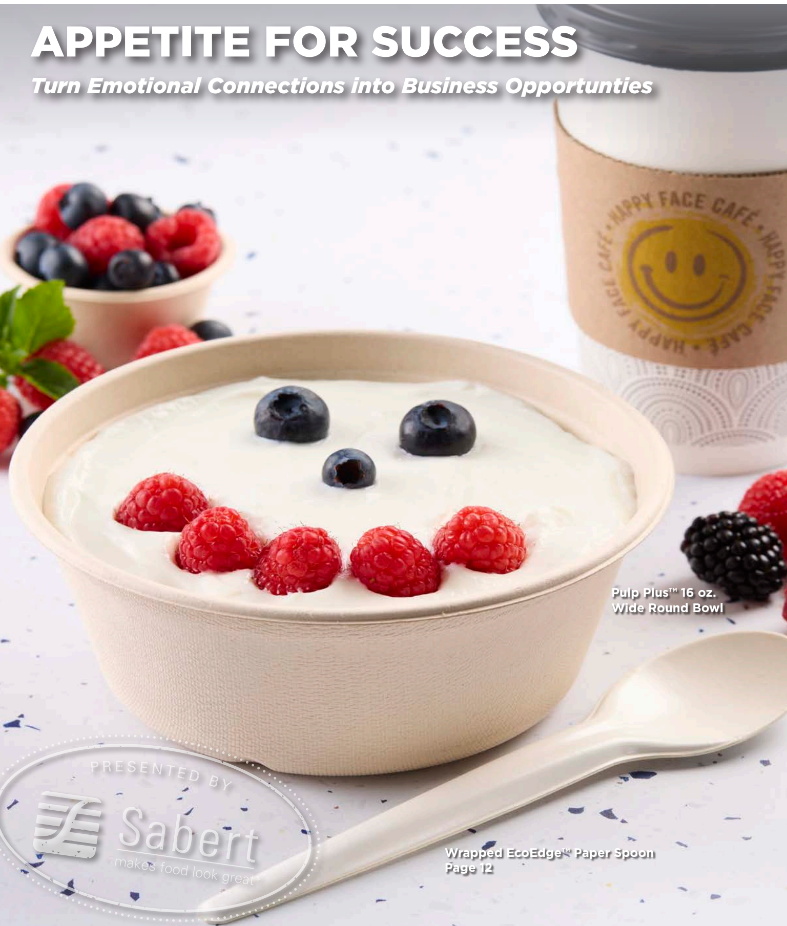
Pulp Plus™ 16 oz. Wide Round Bowl

Turn Emotional Connections into Business Opportunities